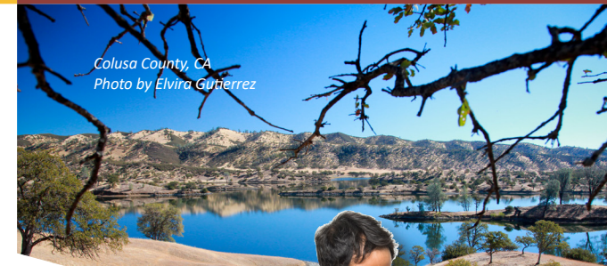
Colusa County, CA

The GSFA Member County "Assist-to-Own" program provides down payment and closing cost assistance (DPA), up to 5.5% of the Mortgage Loan Amount, combined with attractive interest rates for the Mortgage Loan itself.