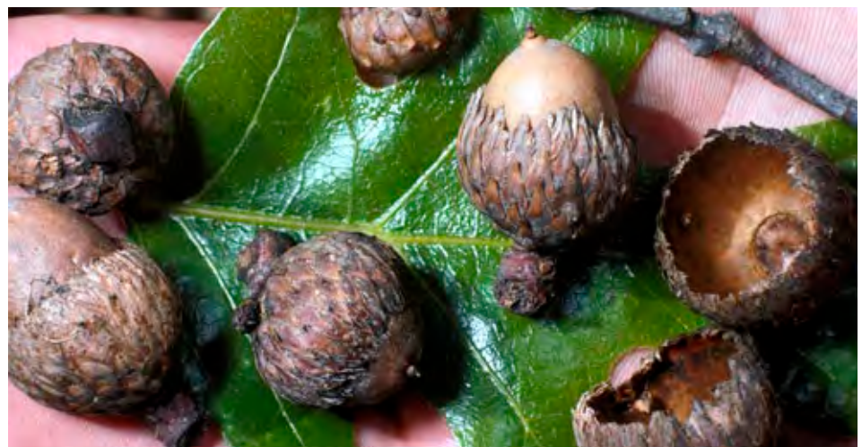
Acorn production among California oaks is highly variable from tree to tree and from year to year.

not regenerating well in certain areas of the state. In addition to poor natural regeneration, the total acreage of these species has been depleted from residential and commercial development, range improvement, agricultural conversions, and firewood harvesting. To ensure that these species remain important components of the natural landscape of California, it may be necessary to encourage natural regeneration or to actively restore oaks by planting acorns or seedlings. During the last 20 years, much has been learned about what works and what does not. Based on research and field trials, we now feel we can successfully regenerate native oaks, although it is often necessary to carefully plant and maintain them. Below are general guidelines for encouraging natural regeneration; collecting, storing, and planting acorns; growing seedlings in containers; and outplanting acorns and seedlings in the field. Additional information is available in Regenerating Rangeland Oaks in California , UC ANR Publication 21601 (see “References”).