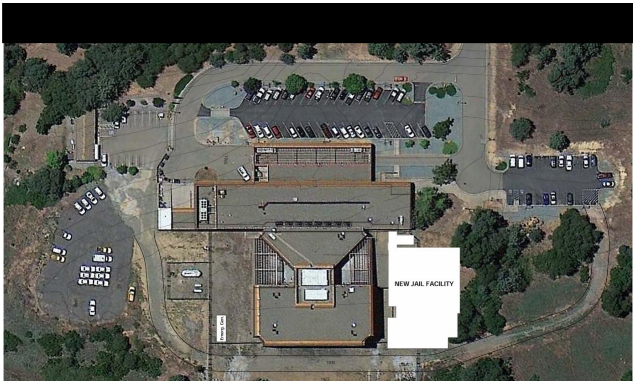
El Dorado County Jail – Placerville Facility Expansion Project

Placerville and South Lake Tahoe Jails and the South Lake Tahoe Youth Treatment Center Inspections